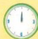
twelve o'clock / noon / twelve noon = midi midnight = minuit