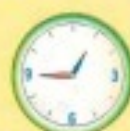
quarter to one (or twelve forty-five)