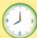
eight o'clock (8 am = 8h / 8 pm = 20h)