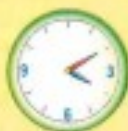
ten past four (am = 4h10 / pm = 16h10) – (am = 6h15 / pm = 18h15)