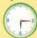
quarter past six