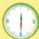
half past twelve (or twelve-thirty)