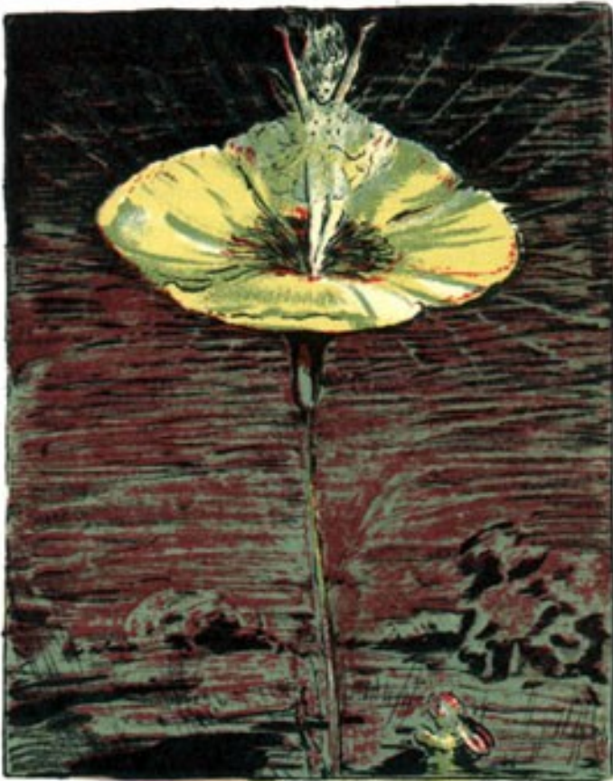
The Fairy Flower

And she held the little Rabbit close in her arms and flew with him into the wood.