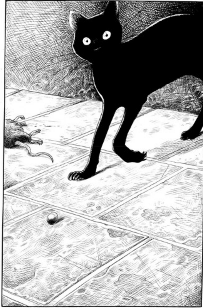
The cat lifted its paw from the marble, which rolled towards Coraline.