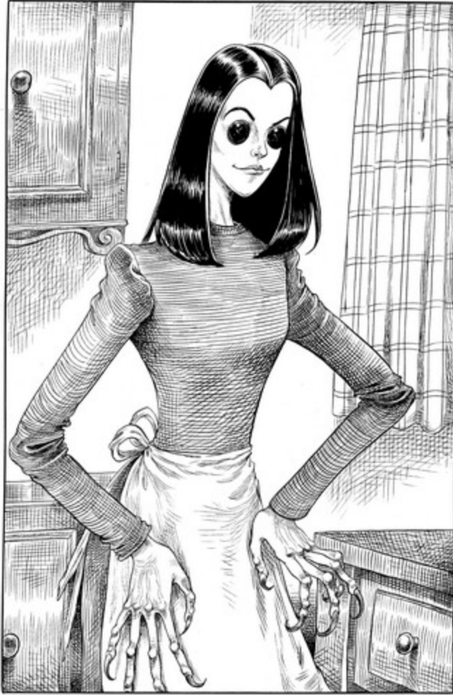
Her eyes were big black buttons.