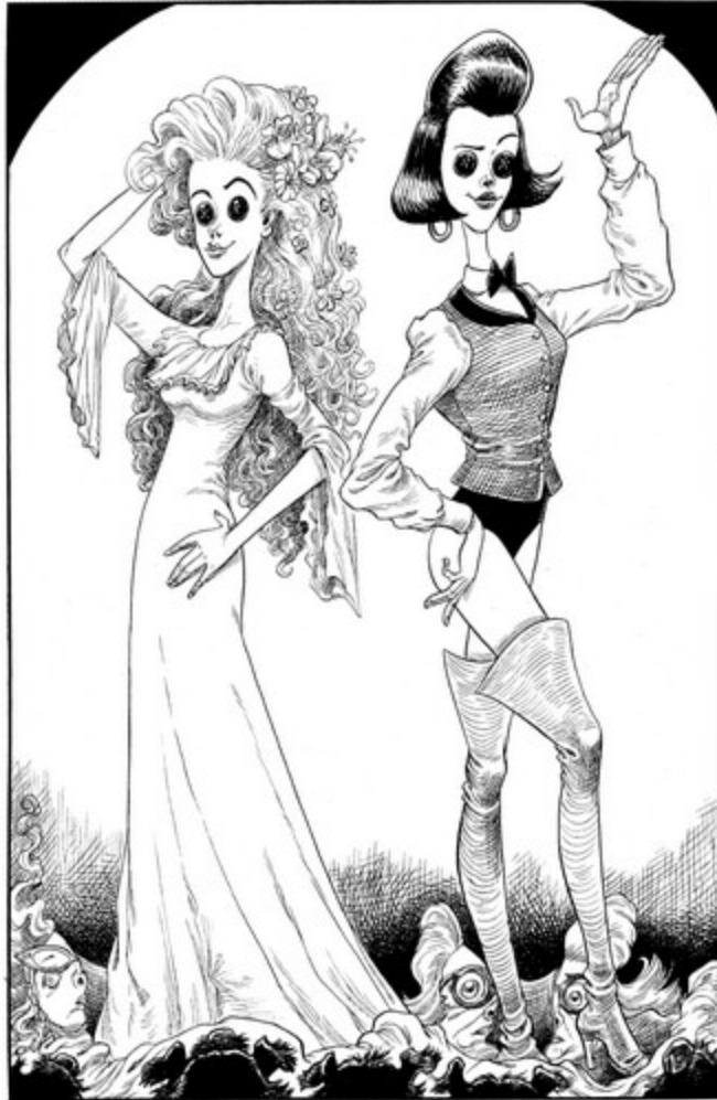
Miss Spink and Miss Forcible came on to the stage.